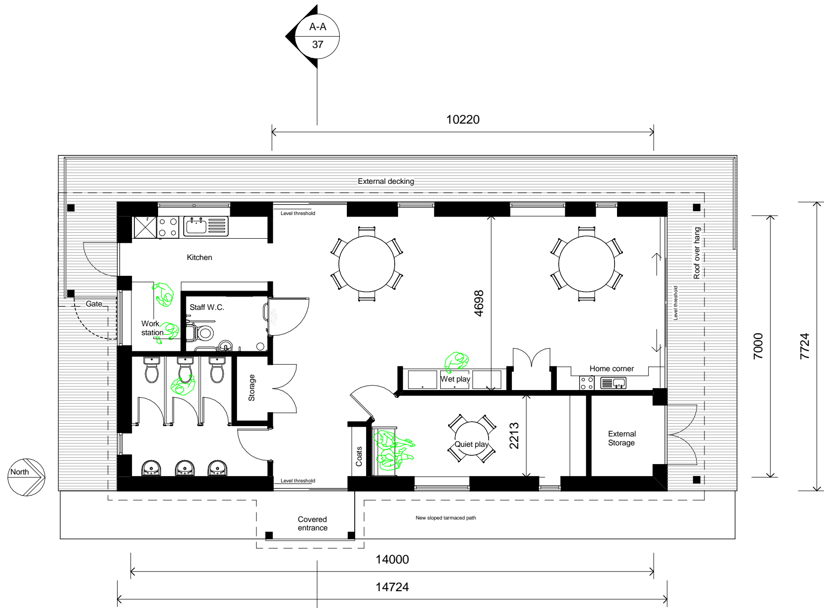
Ground Floor Plan 1 : 100

Contractor must check all dimensions on site. Only figured dimensions are to be worked from. Discrepancies must be reported immediately to the Architect before proceeding. Drawings supplied for purposes of obtaining planning permission must not be used for construction / tender purposes.